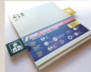
S8 Sliding Door PCS with tactile and braille on door with insert window