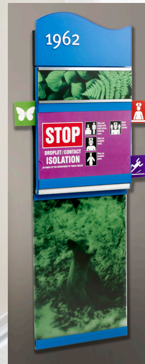
S8 PCS with custom header and insert areas on and below sign