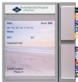
Patient Care Board