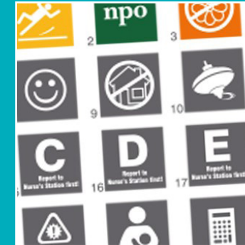
Infinite Icon Library