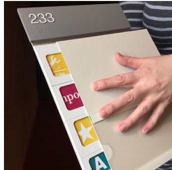
Sliding Door PCS

Your healthcare facility isn't one-size-fits-all, so why should your signage be? L&H Companies has developed four products that can help address your facility's needs in any setting.