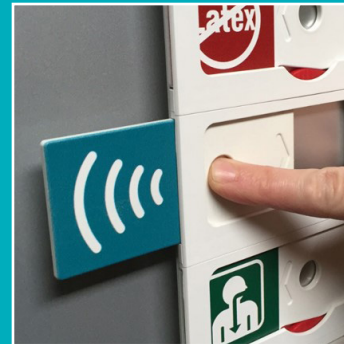
Patented Locking Tabs