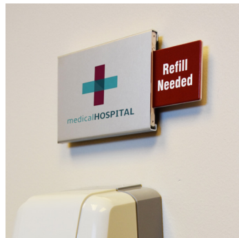
One Icon Notifier