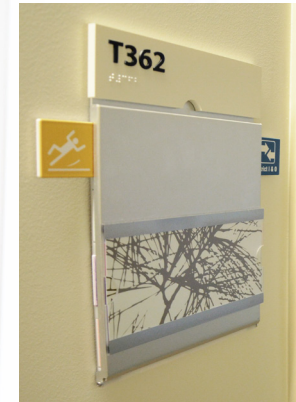
S8 PCS with custom inserts