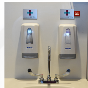
One Icon Notifiers with custom logo printed on doors