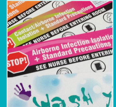
Infectious Disease Inserts

Customize your Patient Care Sign to coordinate with any architectural element or decor in your facility. By applying color, materials, brand and images, we can achieve the look you want.