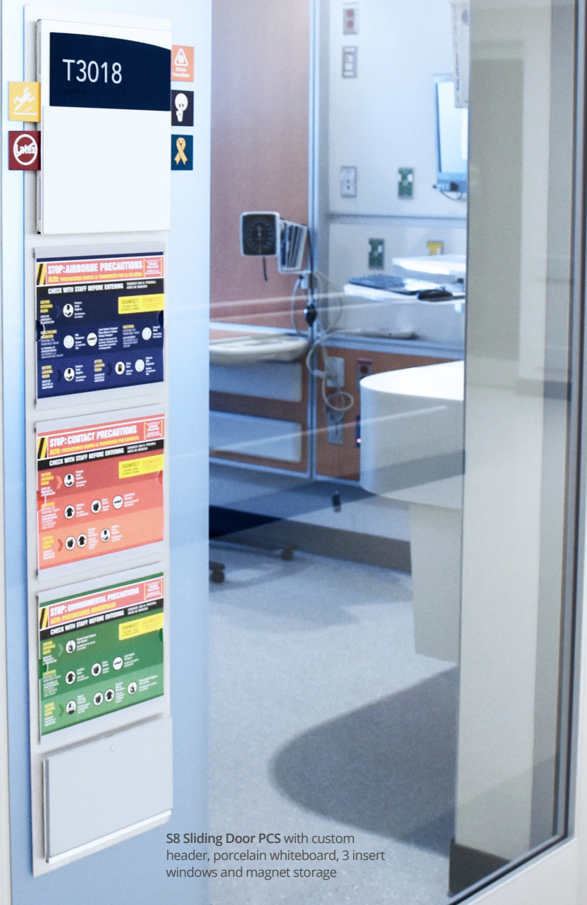
S8 Sliding Door PCS with custom header, porcelain whiteboard, 3 insert windows and magnet storage